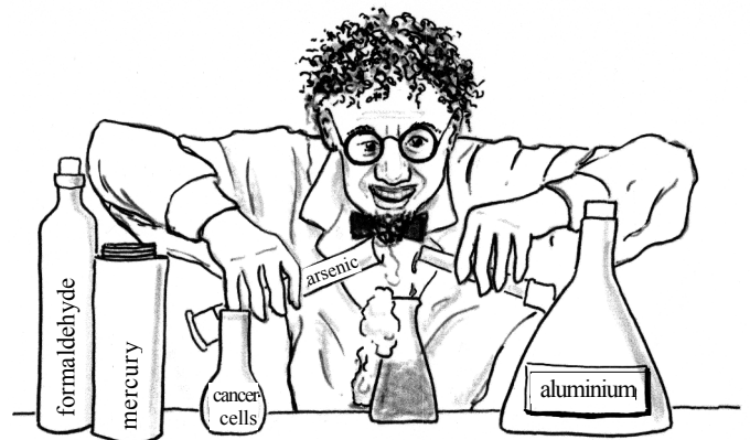
Let's create a new vaccine ...

lowing serious side effects are documented: Autism, flu, diabetes, cancer, nerve damage, paralysis, neurodemitis. The review of 16 vaccines found that vaccines contained nickel, arsenic, aluminium and even uranium. The DGUHT's statements show that the compulsory vaccination would not have to be introduced to protect the population - rather, it would need real information about the dangers of vaccinations, so that, as Dr. Scheingraber points out, citizens can make their own decisions. [2]